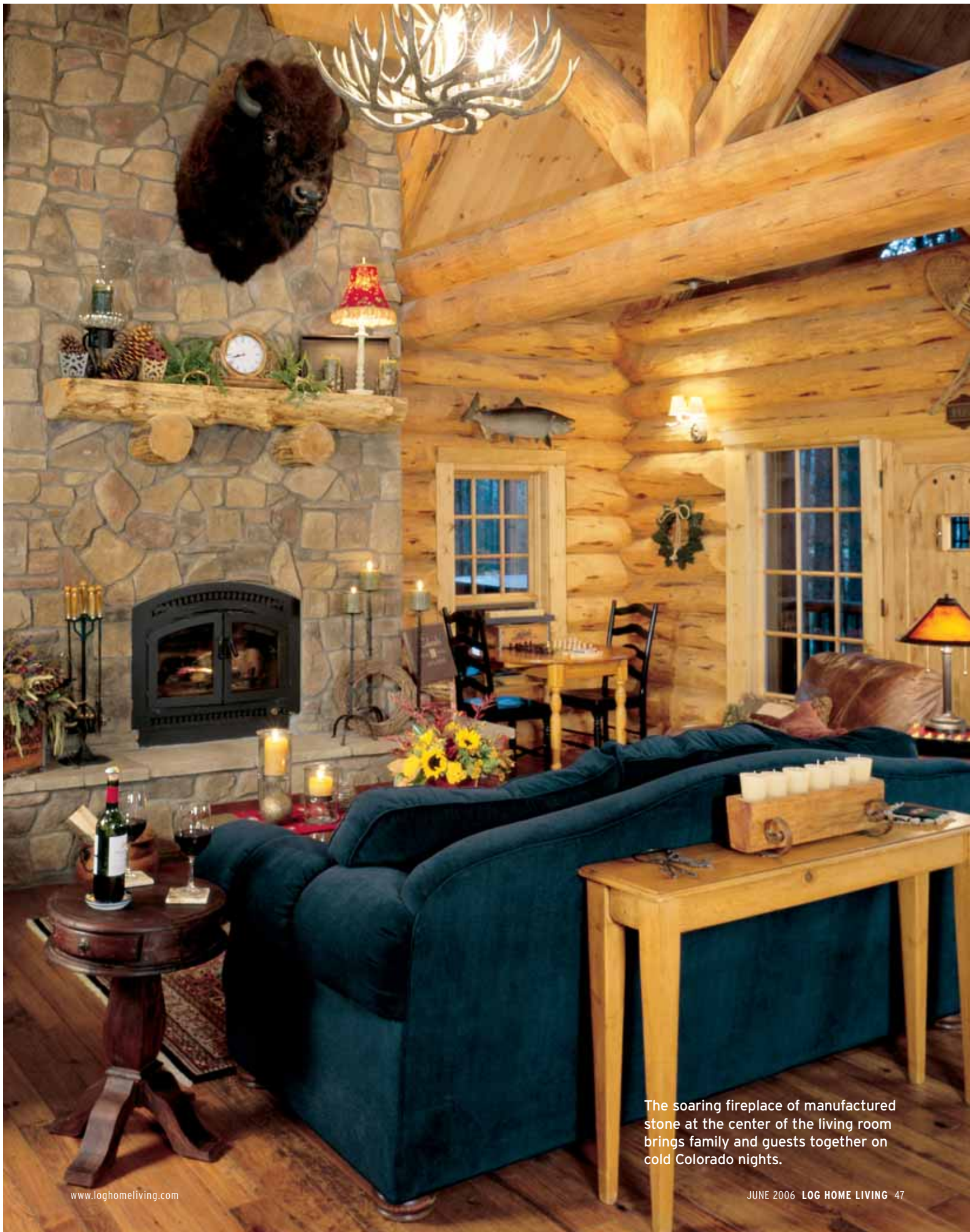
The soaring fireplace of manufactured stone at the center of the living room brings family and guests together on cold Colorado nights.